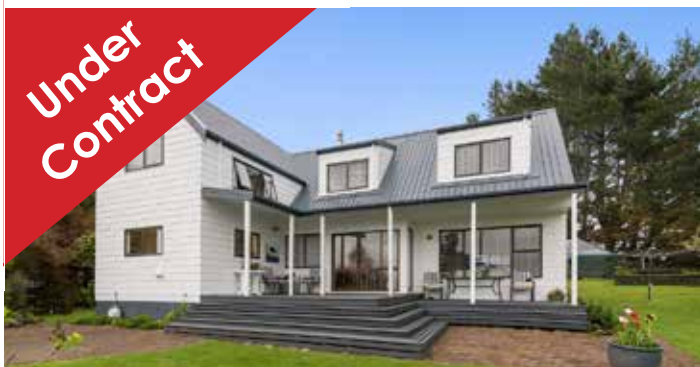
300 Dansey Road