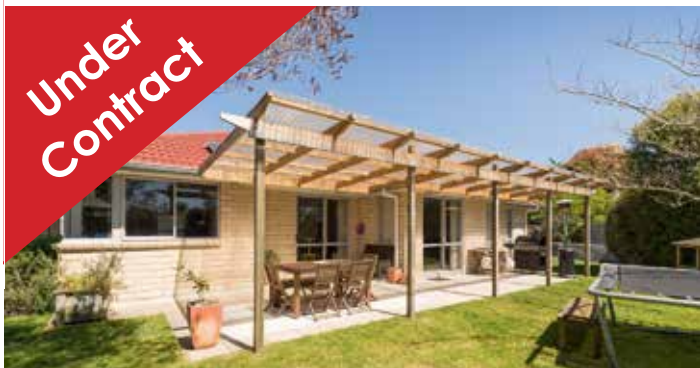
14 Kinder Place