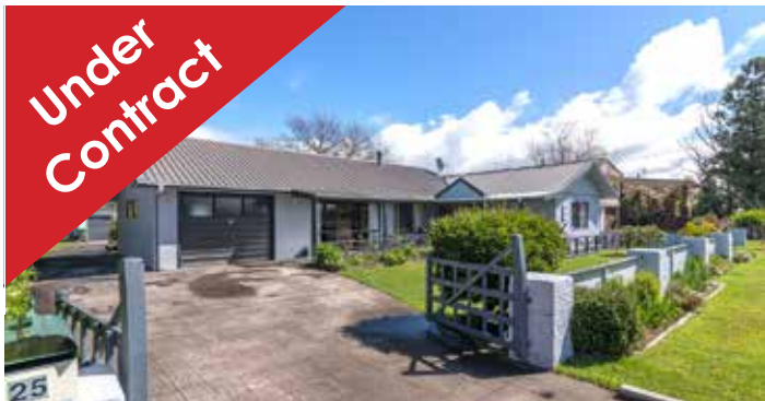
25 Waikuta Road