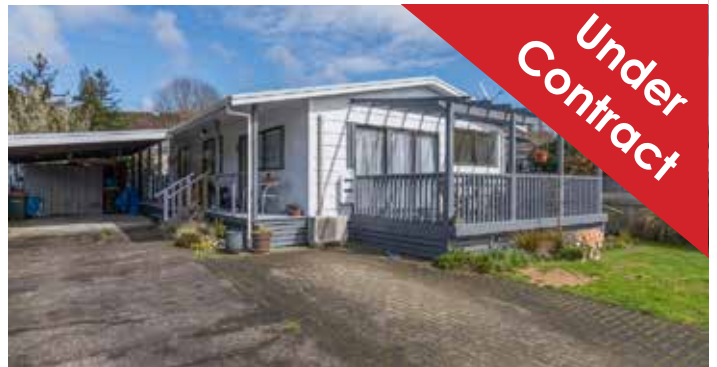
45a Brookdale Drive