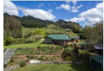
1099 Paradise Valley Road, Paradise Valley