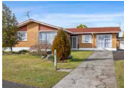
8 Rameses Place, Pomare