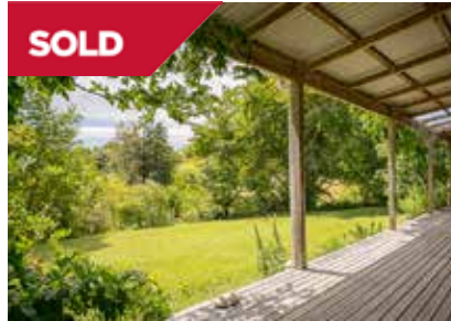
152B Hamurana Road, Hamurana