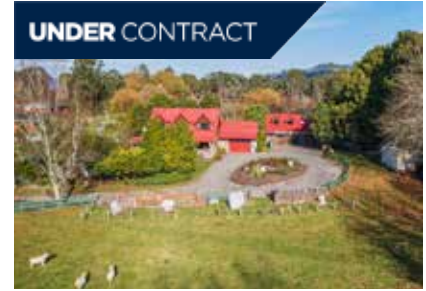
33 Keith Road, Ngongotaha