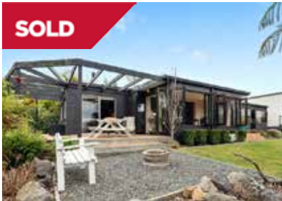
6 Mark Place, Lynmore