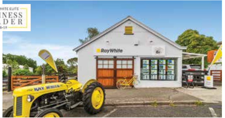
Ngongotaha Village 07 357 5000 rwrotorua.co.nz - Amtos Realty Services Ltd REAA 2008