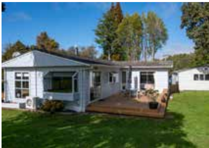
816 State Highway 5, Hamurana