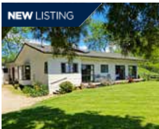
857A Poutakataka Road, Ngakuru