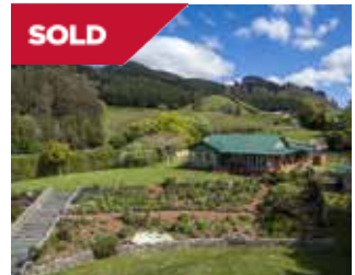
1099 Paradise Valley Road, Paradise Valley