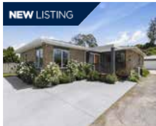
114 Western Road, Ngongotaha