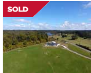
65 Lagoon Road, Rotorua