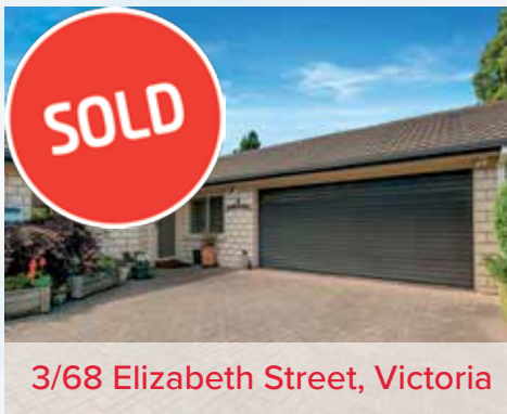
3/68 Elizabeth Street, Victoria