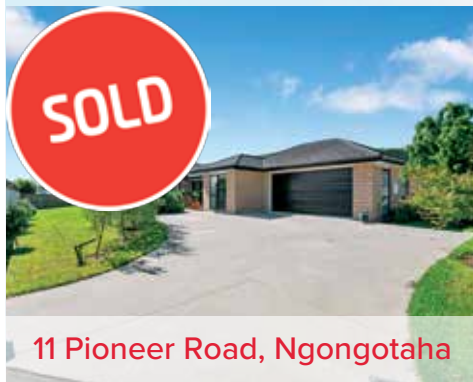
11 Pioneer Road, Ngongotaha