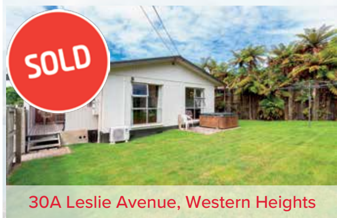
30A Leslie Avenue, Western Heights