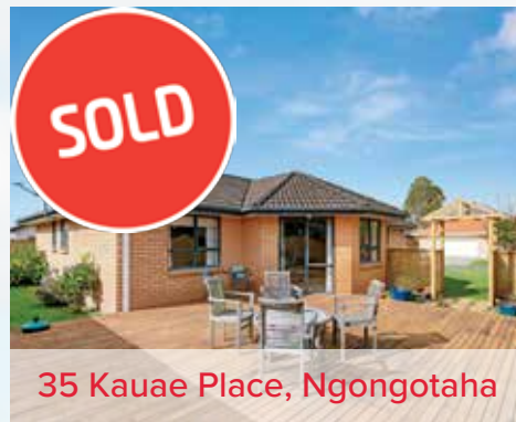
35 Kauae Place, Ngongotaha